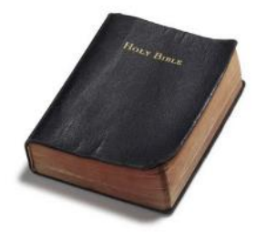
The Bible is the Word of God